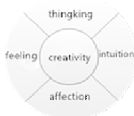
Creativity circle (Barbara Clark, 1988)

As mentioned above, we divide emotions into four levels. However, scholars have not drawn consistent conclusions with regard to the influence of positive and negative emotions on creativity. Some scholars believe that positive emotions can help to foster an individual's creative performance, and the relaxed and warm emotions can have a positive impact on people's creative performance (O'Quin&Derks). The reason is that positive emotions can enable people's stimulated emotional activities to interact with their cognitive activities, thus enhancing their cognitive attention, association, resilience, and elaboration (exquisiteness), and they are therefore able to see similarities and differences between things and excel others in creative thinking and performance (Ien & Daubman, 1984). For example, Isen & Daubman (1984) found in the experimental results that the group with positive emotion was more creative. Hirt (1995) found that positive emotion groups had better fluency in oral expression than subjects in the control group. Some scholars have studied from a biological point of view, believing that positive emotions can increase the activity of dopamine in the brain, and promote the selection of cognitive flexibility and cognitive choices. This theory explains why positive emotions strengthen cognitive activities such as smell and memory, and enhance creative thinking and problem solving.