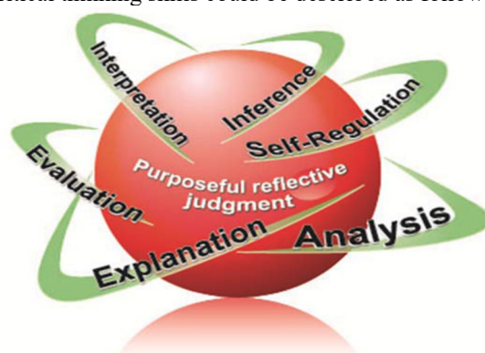
Figure 1. The process of Critical Thinking Skills

Critical thinking occurs through processes, stages, logical and concrete. The critical thinking process is divided into six skills, namely interpretation (Interpretation), analysis (Analysis), evaluation (Evaluation), conclusion (Inference), explanation (Explanation) and self-regulation (Self-regulation). Facionne (Facionne 2013, 2) explained that the process of critical thinking skills could be described as follows: