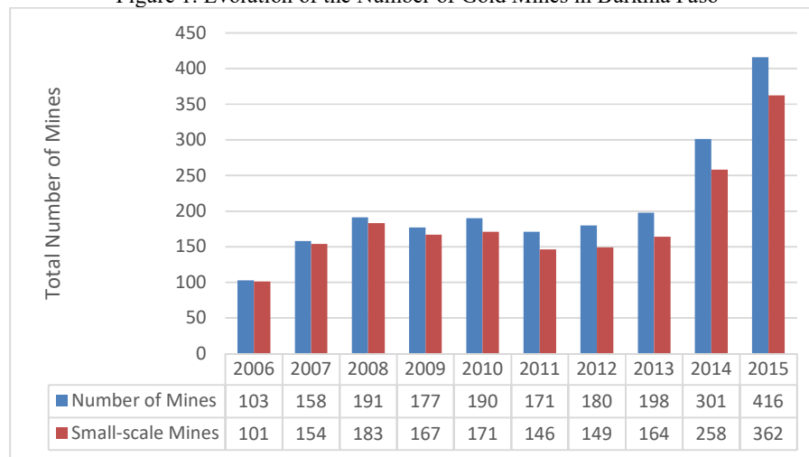
Figure 1: Evolution of the Number of Gold Mines in Burkina Faso

Created by Author based on Burkina Faso Ministry of Mines statistics