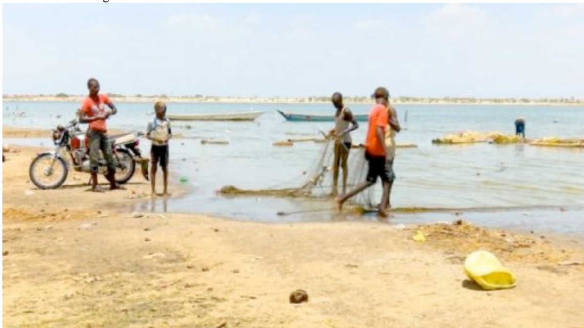
Fig. 3 Fishing at the shores of Lake Turkana

The second most reliable economic activity in Turkana County is fishing in Lake Turkana. The photograph below shows fishing at the shores of Lake Turkana.