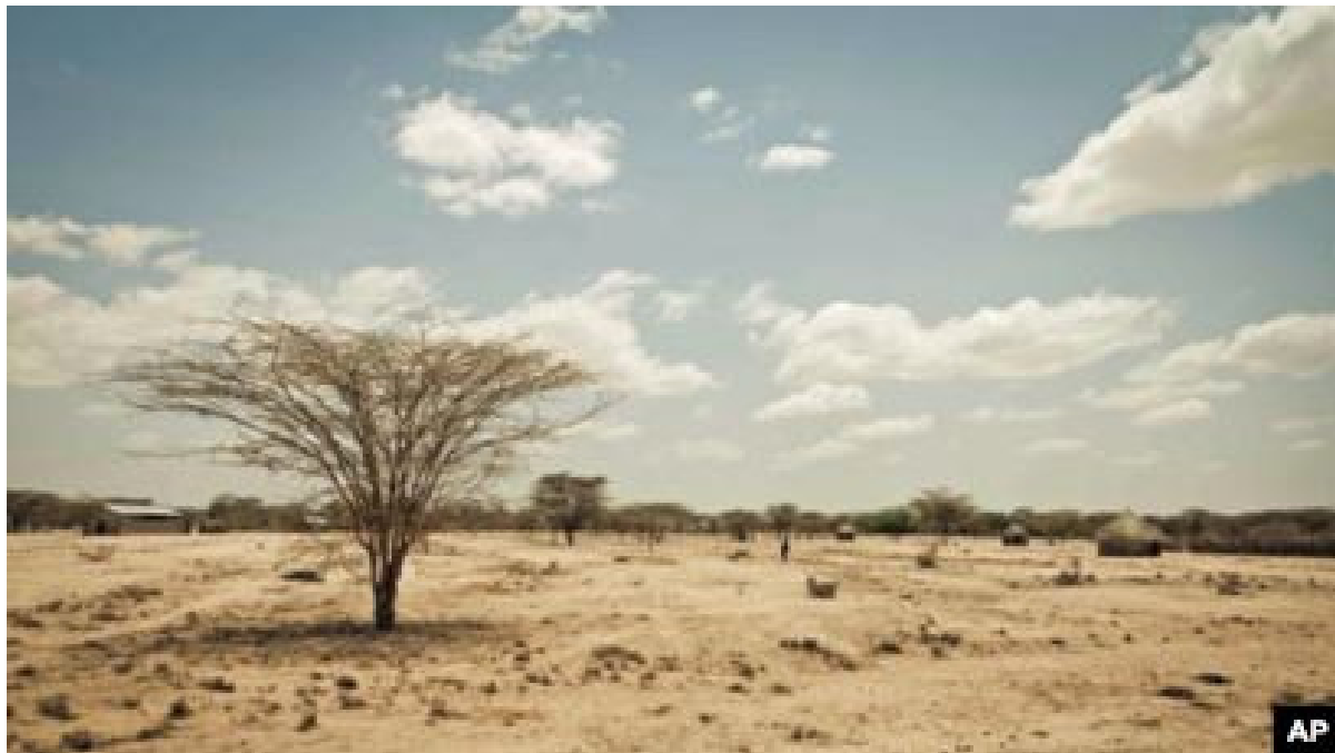
The climate of Turkana County - Kenya

The main economic activity and source of livelihood in Turkana County is livestock rearing ( cows, goats and camels ). It is a flourishing source of livelihood, specially during wet seasons