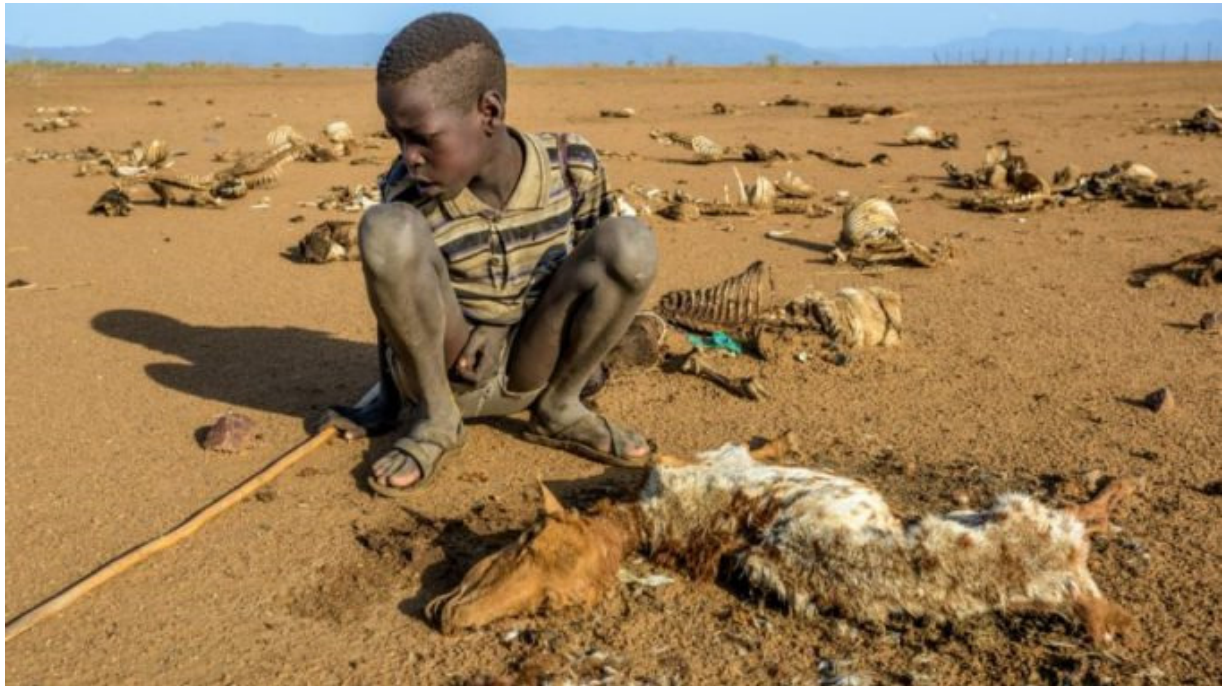
Fig.2 The effects of long droughts in Turkana County

From the figure above, it is clear that the effect of long droughts and lack of water has caused serious devastations on the lives of Turkana people. Many children drop out of school to assist their parents in search of pasture and water for their livestock. None the less, the county is experiencing progressive development brought about by devolution and mineral explorations and inventions, especially of oil and water resources.