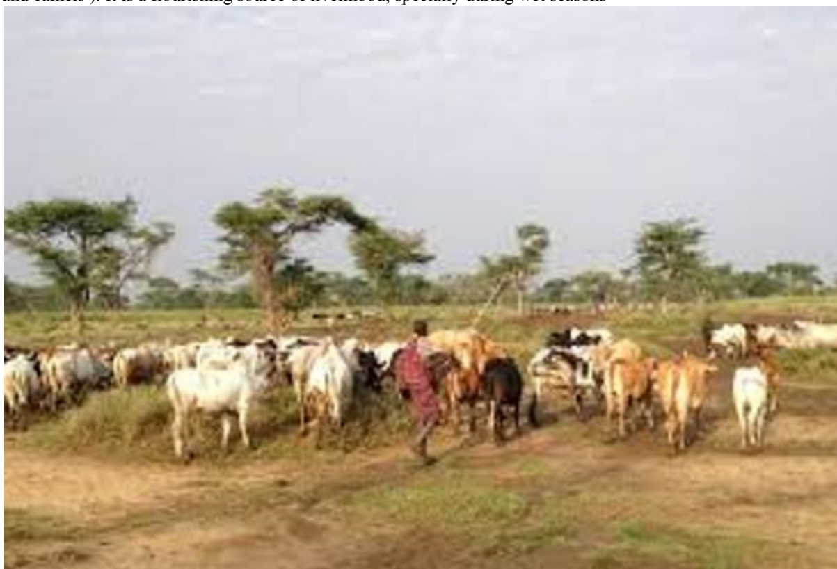
Fig. 1 Cattle herding in Turkana County

The main economic activity and source of livelihood in Turkana County is livestock rearing ( cows, goats and camels ). It is a flourishing source of livelihood, specially during wet seasons