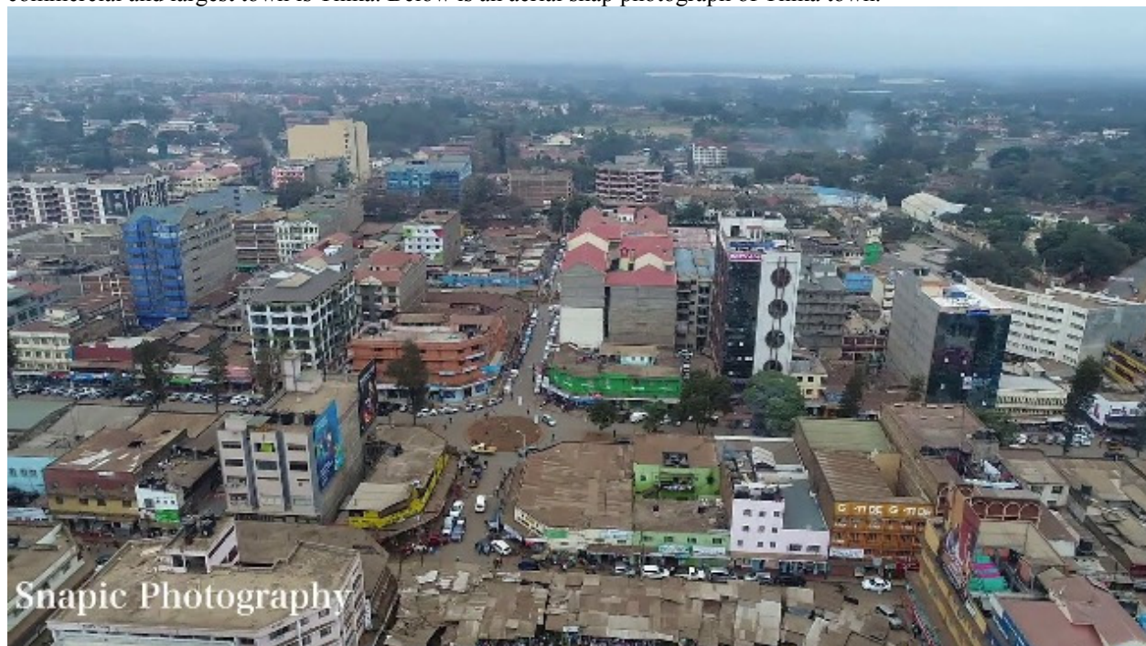
Fig. 5 Aerial view of Thika town

farming, Trade and industrial activities are other sources of wealth in Kiambu County. As stated earlier, the main commercial and largest town is Thika. Below is an aerial snap photograph of Thika town.