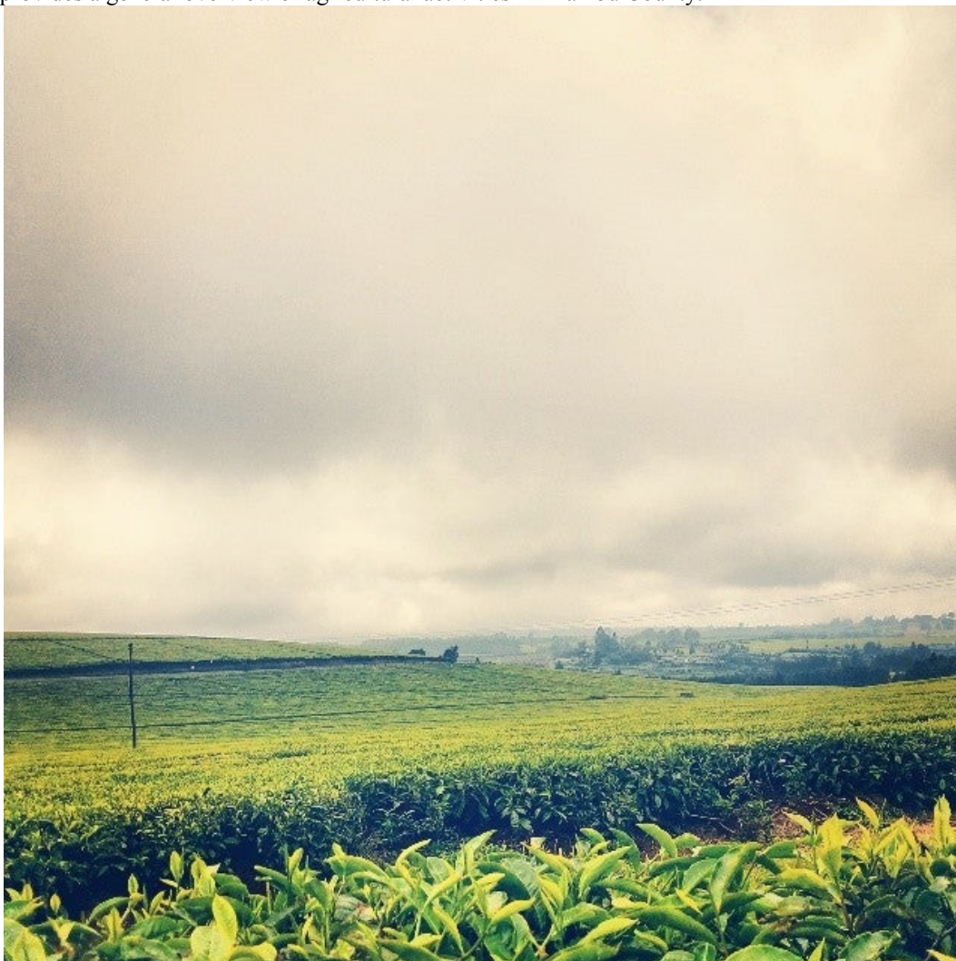
Fig. 4 Tea farming in Kiambu County – Kenya

Farming and business are the main economic activities. The cool climate and consistent reliable rainfall makes it conducive for farming. June and July rank as the coldest months while January-March and September-October are the hottest months. The main commercial farming is growing of tea and coffee. The county is adjacent to Nairobi City which is also the capital city of Kenya. Thika is the largest town in Kiambu County and also the industrial hub of Kenya. As such, the county relies mostly on agriculture and industries to sustain its economy. The picture below provides a general overview of agricultural activities in Kiambu County.