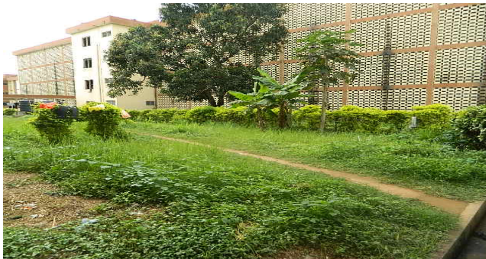
Plate 2: One of the hostels lacking recreation facilities

the majority (75.2%) of the students interviewed. However, few of them refuted this affirmation, probably because of availability of the facilities in their hostels or blocks. Another reason may be as a result of the location of their blocks or hostels close to public contact, more attention may be given to the cleanliness of such blocks or hostels to portray good image of school hostels.