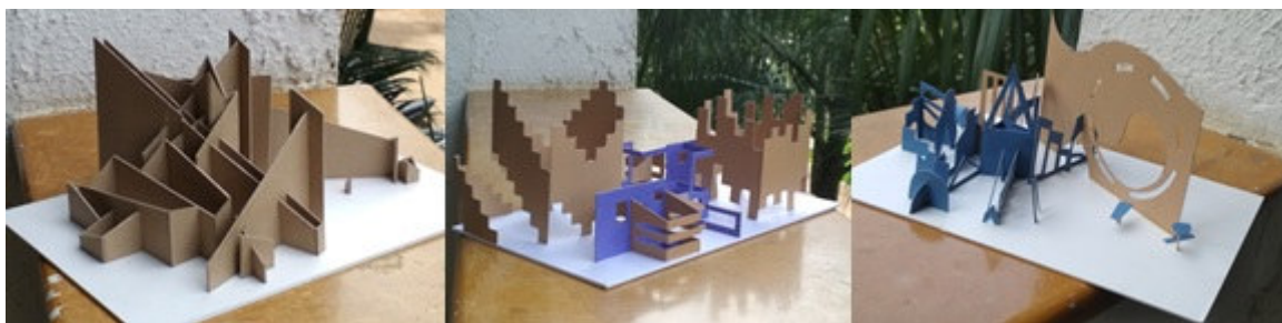
Stage 2 and 3: Students output of 3D composition with extrusion and cut outs.

Such an attempt enhances the potential of Basic Design as a process to transform the learner's ability in terms of space and dimensions, explorations of colors and textures, light and shade. Therefore, basic design purpose here as vital 'tool' of transformation of learners to architects.