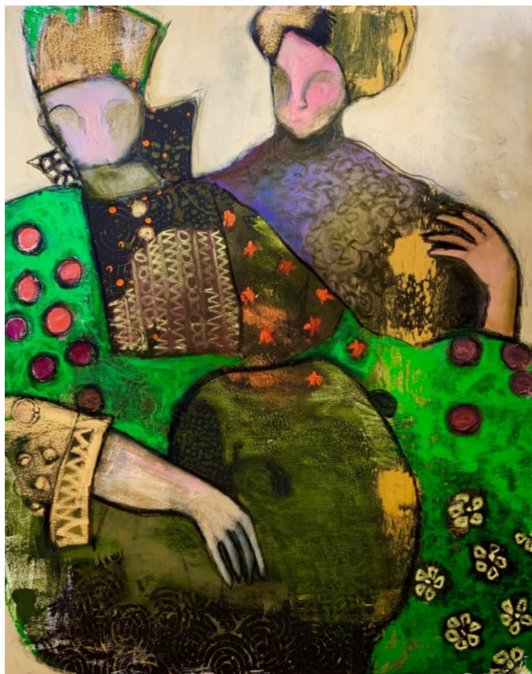
Figure (4): Alia Al-Farsi (2019), mixed media on canvas, 100 X 81.

Postmodernism as a term was coined around the 1970s. It is not easily defined as it includes a vast number of art styles and theories and is not based on a certain theory or style. In contrast to Modernism, Post-modernism as an art movement did not emerge cohesively (Lindas, 2013). What sets Post-modernism apart from other art movements or theories is its “questioning of the master narratives that were embraced during the modern period...” It mainly questioned the idea of technological progress as to how it was viewed as a negative thing. Other ideas that were rejected by postmodernists is that only men can be artistic geniuses and the colonial assumption that people of color are second class citizens. Moreover, Postmodernism abolished the notion of there being one explanation or interpretation to a work of art (that being the explanation given to us by the artist after creation), the viewer is said to be an integral part of the meaning of the work of art.