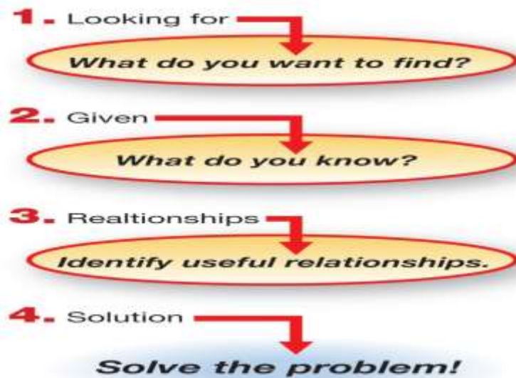
Fig. 3.2: The four-step technique problem-solving flow chart. This describes the steps to follow to really understand the problem on hand.