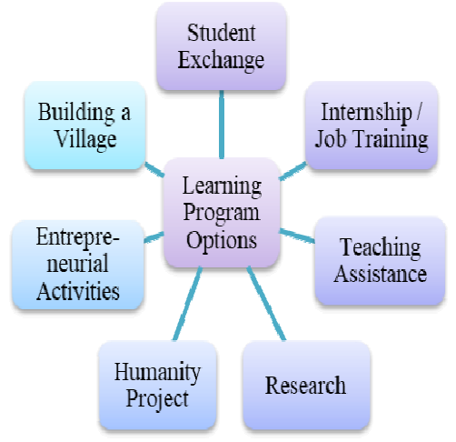
Figure 2. Student Study Rights Elective Program