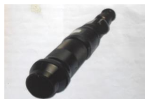
Figure 2. Stunning tool

The use of kosher stunning tool can reduced livestock's stress and pain before slaughtered. Stunning system is conducted without breaking the skull and it guarantees the kosher and animal welfare requirement. Mushroom head shape of the slab in this tool will prevent fatal or excessive damage to the livestock's skull. The various capacity of power load is based on the cow's size, whether it is small, fair, or big. By using kosher stunning tool, the quality and the profit of meat can be enhanced. Stunning technique is illustrated in fig. 3. Stunning box is a place for entering the cow (3a). The officer demonstrated the use of stunning tool (3c). From the top of the stairs, he pressed the cow head using stunning in the determined spot (3d). Stunning box was slowly opened and the cow immediately slaughtered (3e). The stunning process needs \pm five minutes.