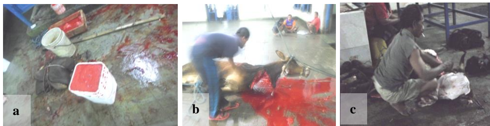
Figure 5. Violation on Malang Slaughtering House Regulation

It wrote: "ATTENTION: Whoever took the blood of slaughtered livestock without written permission from Director may be subject to the applicable provisions".