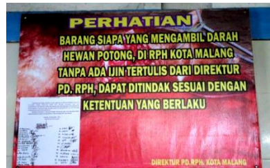
Figure 4. Warning Banner in Malang Slaughtering House

It wrote: "ATTENTION: Whoever took the blood of slaughtered livestock without written permission from Director may be subject to the applicable provisions".