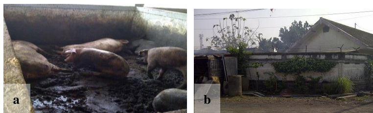
Figure 6. Pig stall. a) inside; b) backside