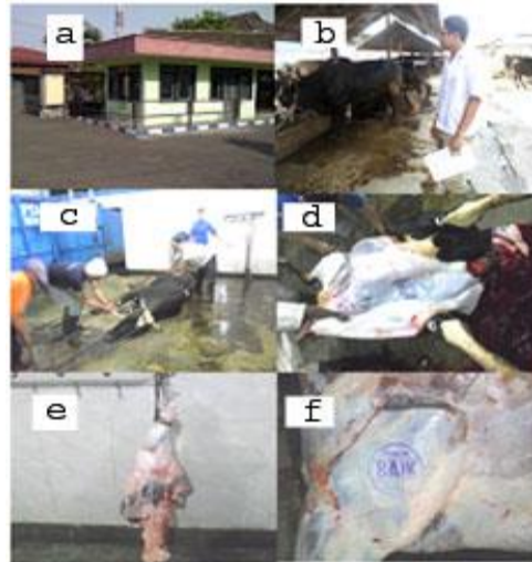
Figure 1. The Procedure of Livestock Slaughter in Malang Slaughtering House

Slaughter process is conducted to get meat which is safe-consumed, healthy, intact, and kosher. To produce high qualified meat and fulfill such characteristics above, the slaughter process is conducted in Islamic procedure supervised by a vet or Keurmaster Officer (Fig. 1).