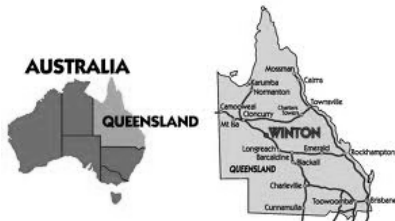
Figure 1. Winton map

Winton Shire is a large locale of some 54 000km 2 located in western Queensland (Qld), Australia. The expected population by 2011 will be between 1520 to 1560 people (Department of Infrastructure & planning, Qld Gov, 2010)