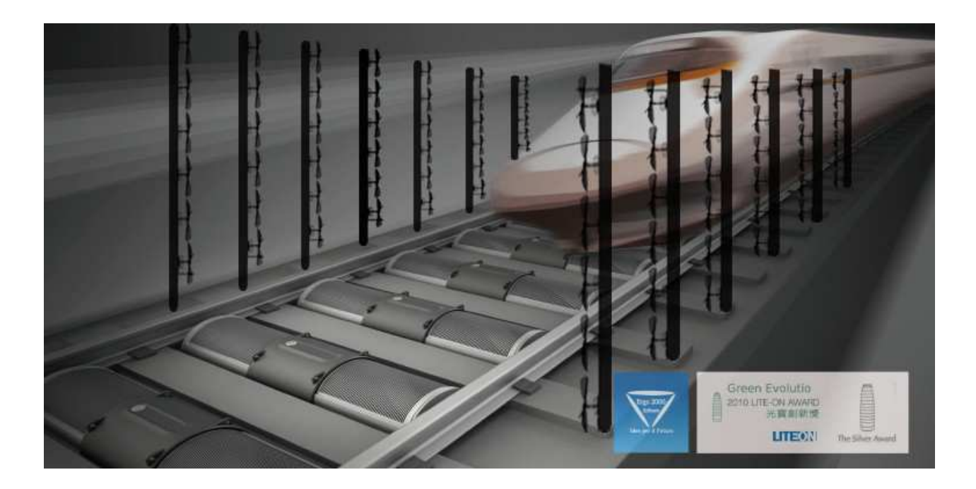
(fig 1 : showing an implemented assembly of turbines on installation poles)