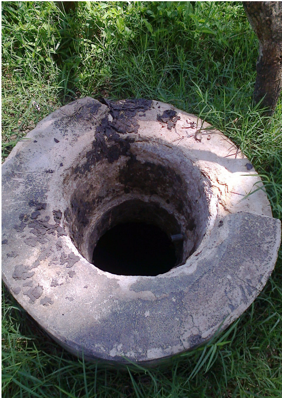
Figure 4: Abandoned biogas plant due to lack of technical services