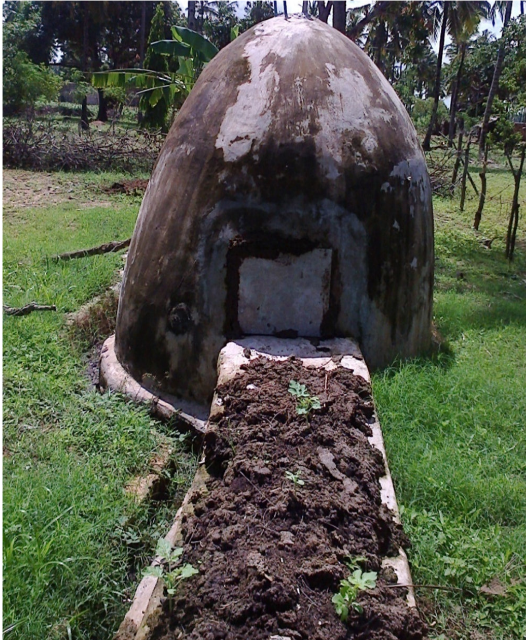
Figure 3: An incomplete biogas plant due to lack of technical services.

competent and skilled service providers adoption of biogas will remain a great challenge. The failure of most biogas plants has led to biogas technology acquiring a less favorable reputation which affected the penetration rate of biogas technology (Ngigi, 2010). Bensah and Hammond, (2010) observed that users of biogas plants had little or no knowledge of the functions of the biogas plant and this contributed more than any factor to the breakdown of most biogas plants in Ghana. Those who showed interest in this technology also lacked the technical support on construction and maintenance matters or any information they would have liked to know. Personal communication from a key informant in the Ministry of Energy also confirmed that it is a challenge to his office since he has a few staff that are meant to serve the whole of Coast region.