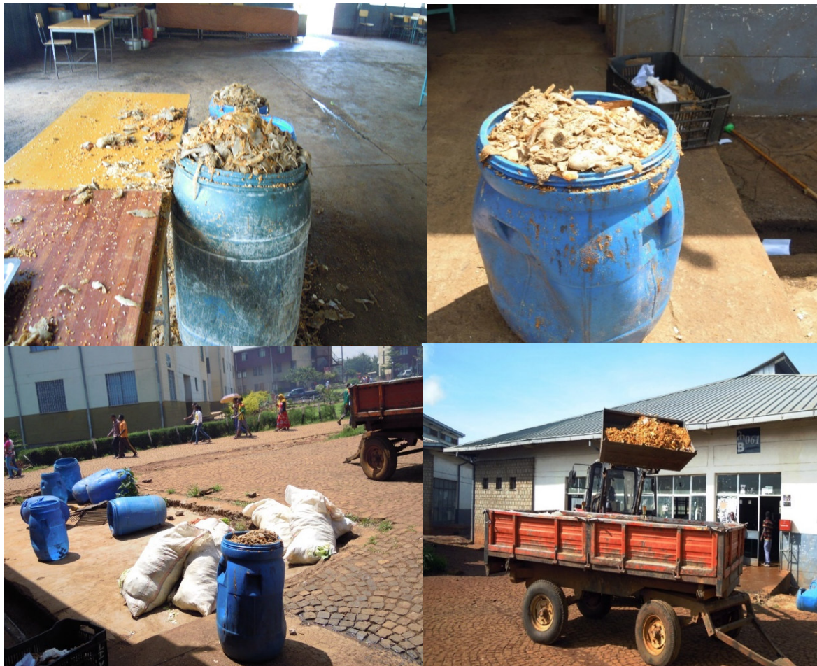
Figure 1 The food waste in WSU students' Cafeteria

To gain an understanding of the compositional variability of the food waste, ten samples of each of the four categories of the food wastes with one kilogram of each food waste category in a composite of five were collected from each of the food menus of the cafeteria. The raw waste was screened to remove the coarse contaminants and then finely ground by electric blender to maintain homogeneity and made small size for preparing it for anaerobic digestion. For each sampling, 100 g (wet weight) of the ground food waste samples were taken to food characterization and analyses at JIJE Labo-Glass laboratory, Addis Ababa, Ethiopia. All collected food waste samples were analyzed for percentage of total solids (% TS) by AOAC Official Method 920.47, 940.09, 950.27; and percentage of volatile solids (VS) contents by (APHA 2540 E. Fixed and Ignited at 550°C) and contents of percentage total nitrogen (% TN) contents by AOAC Official Method 920.87 in JIJE Labo-Glass laboratory. The percentage of Total Solids (TS) was calculated as follows: