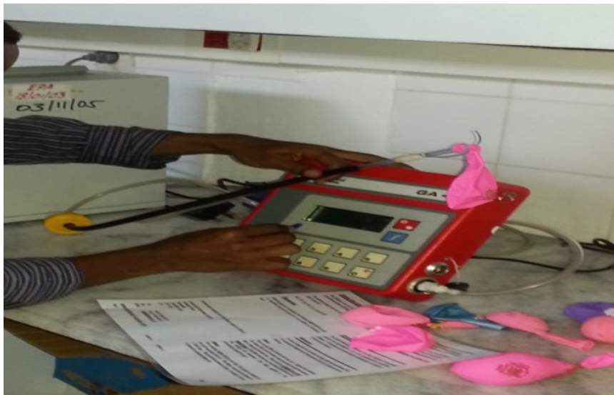
Figure 3 Measurement of biogas quality (CH 4 & CO 2 proportion) by Geotechnical instruments GA45

Biogas samples generated from the anaerobic digestion of the sample food wastes with bacterial inoculum (methanogenic bacteria) at the laboratory were collected from the gas collection bubbles and analyzed for percentage of methane and carbon dioxide content were measured using “GA45 Infrared Gas analyzer” equipped with two (internal and external) filters at Environmental Protection Authority of Addis Ababa City administration (Figure 3). The volume of biogas produced from 100-gram food waste was measured by the water displacement method.