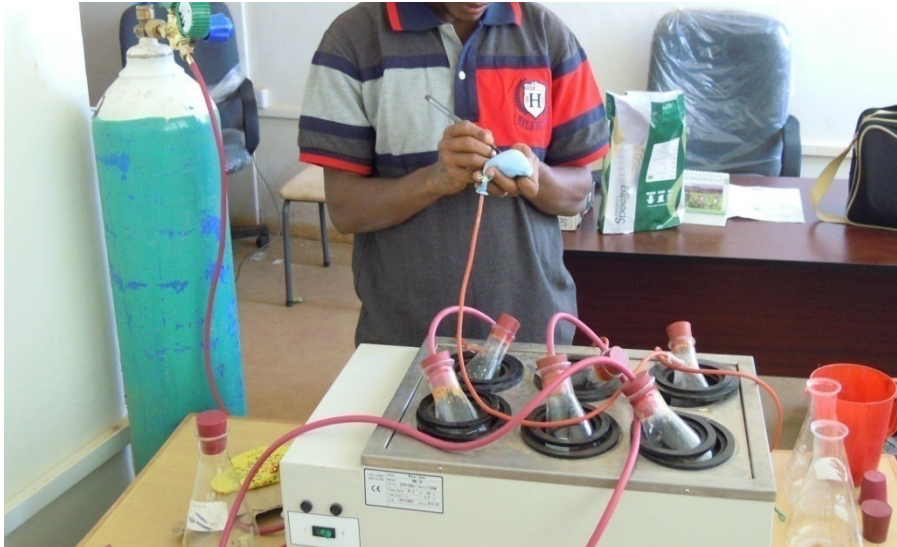
Figure 2 Digesters inside the water bath during anaerobic batch digestion

tests were performed on the food waste samples collected from the representative samplings of each food waste category. The composite samples were prepared by mixing similar food waste samples and then taking 100g representative samples from the mixture of each food waste category. The food waste samples were digested in a batch digester, at a mesophilic temperature (35 °C) which help to develop anaerobic bacteria (Barik and Murugan, 2012) using an electric water bath for 25 days in a pH of 7 (Budiyono et al., 2013) (Figure 2). Biogas from each digester was collected in a plastic bag (Figure 2). At the beginning of the digestion tests, in each digester, bacterial inocula were mixed with food waste.