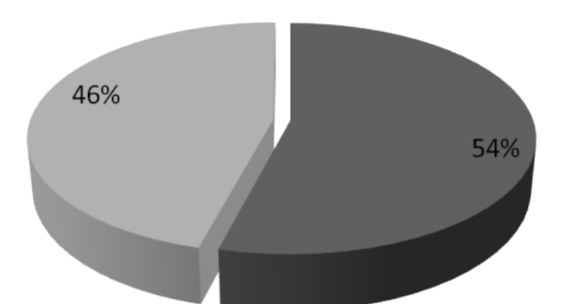
Figure 4. Energy Consumption in different types of vehicles per fuel. Source :( SECAP,2012). Modified by Author, 2022.

"An advanced city is not a place where the poor move about in cars, rather it's where even the rich use public transportation" Enrique Penalosa. In municipal fleet have different types of vehicles with the greatest number of pick-up vehicles followed with passenger vehicles and at the third level is construction vehicles and the least amount number of vehicles is buses. These vehicles are consumed diesel energy more than the gasoline. Whereas public transport refers to the buses and taxes that serve the citizens of Aqaba. The most amount of vehicles types is taxes using only gasoline fuel followed with small buses and coach buses which they use both diesel fuel. Therefore, private and commercial transport according to the registered private and commercial vehicles are 20,541 number. The most amount number of small passenger cars which uses only gasoline fuel followed with (small buses (van), cargo vehicles, trailer (trucks), construction vehicle and medium passenger cars) arranging according to their numbers which uses only diesel fuel (SECAP of Aqaba,2012). In the next figure the proportion between Diesel and Gasoline in the Private and Commercial vehicles and public vehicles. Also, in municipal fleet different types of vehicles as presented, with gasoline being the dominating fuel.