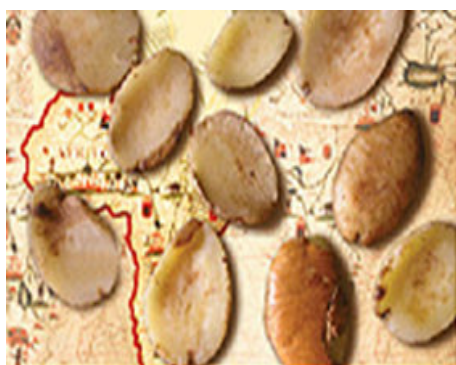
FIG. 1 Irvingia gabonensis seeds