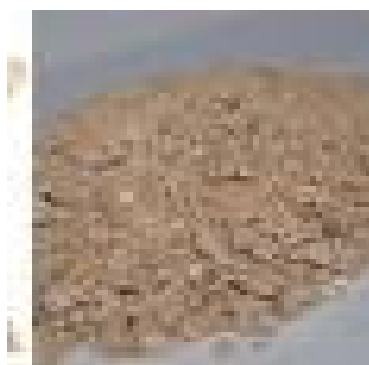
FIG. 2 Pulverized Irvingia gabonensis seeds