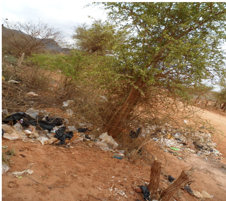
Plate 1: Polluted wild bushy area used for plant collection

Herbalist 2 was a member of Kiambu County Herbalist and Biodiversity Conservation Association. This organization advocates for replanting of various herbs for conservation purpose. A cultivated herb garden was observed at his premises. Pictures of some of the cultivated plants are shown in plate 2.