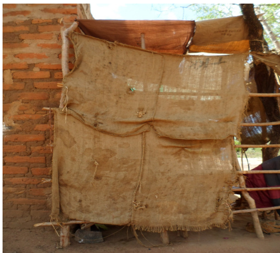
Plate 4: A herb drying shelter