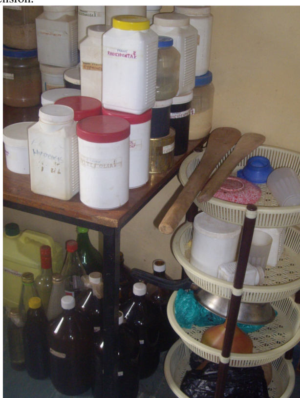
Plate 10: Formulation room with equipment.

One herbalist processed and formulated his drugs at a separate location from his clinic (plate 10). All others prepared the drugs at the same location where they received patients. Three TMPs dispensed their drugs as powders and one as a suspension.