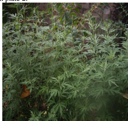
Plate 2: Cultivated herbs behind a herbal clinic

All TMPs purchased some of their herbs from markets and from other herbalists. Herbalist 1 said that he also imported herbs from other countries.