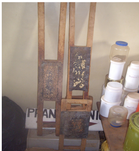
Plate 9: Handmade drug graters