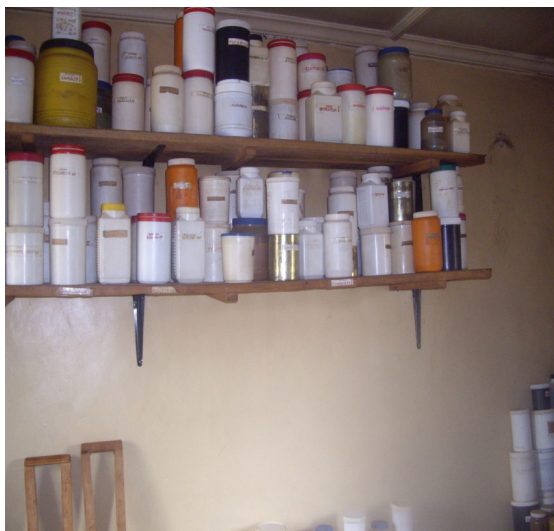
Plate 3: Stored ground herbs at herbal clinic