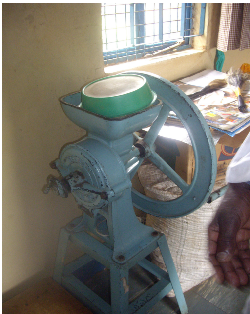
Plate 7: A modern commercial mill used by herbalists

Grinding saved them time as the ground product was stored in plastic containers for later use. Change in odor and appearance was used to determine expiry of the product. This skill to identify deterioration was gained through experience.