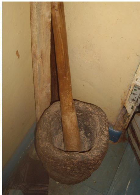
Plates 5 and 6: Traditional tools (pestle and mortar) used to process herbal medicine