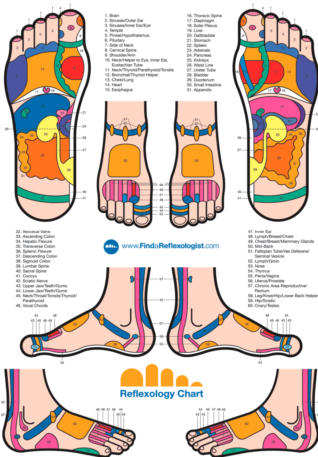
Figure 1 Reflexology chart (Technology therapy group, 2012)