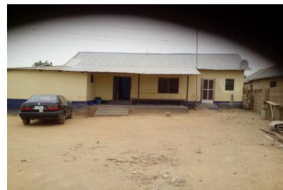
Plate h: COCIN Dispensary, Gyel (Mission)