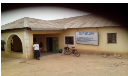
Plate g: Grace Land Clinic and Maternity, Takum, Gyel