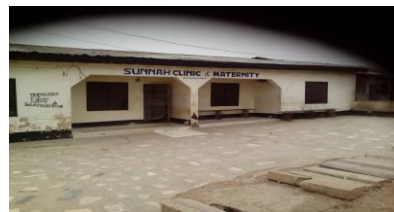
Plate d: Sunnah Clinic at Gero Road Bukuru Central