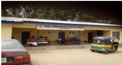
Plate c: ECWA Comprehensive Health center (Mission) Central