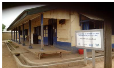
Plate b: PHC BUKURU Central