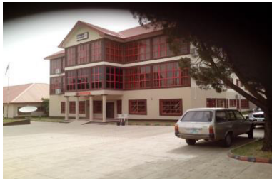
Plate a: Premises of Dee Medical Center