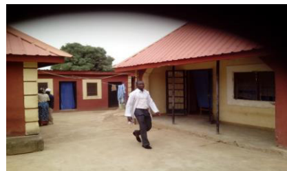
Plate f: Frontage of Gyel Central Hospital, Tanchol