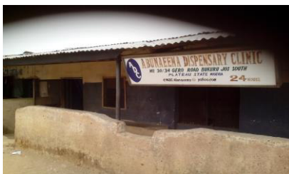
Plate e: Abunaeema Dispensary at Gero Road Bukuru Central