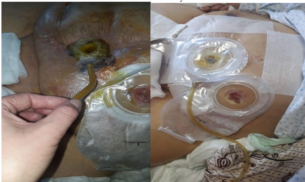
Figure 3 Step by step closed open abdomen, end colostomy and one ileostomy by taking advantage of mucosal hypertrophy adducted proximal- distal bowels

We continued the same treatment for about a year, the wound got smaller but the brides did not soften, and we had to continue with TPN and trace element therapy due to the ongoing short bowel. This caused cholelithiasis sometimes cholangitis, one of the problems related to the TPN, and we did ercp for the occasional cholangitis attacks. However, because of the adhesion, cholecistectomy was impossible as it would create new injuries. Reoperation was impossible to close the fistula, the loops were far apart. A new formula was needed, all similar cases in the literature were screened, there was no same situation or patients had been lost in a short period of time within 6 months. Mucosal hypertrophy in the proximal bowel due to chronic fistula gave an idea. Mucosal hypertrophy almost closed the 10 cm dissociated distance. If we could combine it, we could use this hypertrophic mucosa as a graft. If the fistula was cut, the skin that was almost closed with the vac would cover the graft and both the fistula and the skin would be closed. In the literature, mucosal hypertrophy in fistula intestines is a known condition, but it has never been used for fistulas, cyanoacrylate, the silicone fistula plug (1) method has been used, but where they are used, there are no fully dissociated bowels or without serosa