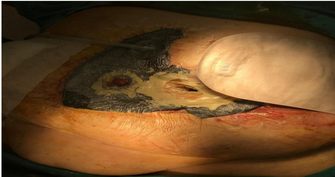
Figure 2 NPWT approaching with end colostomy, distal and short proximal small bowels by making artificial ileostomy