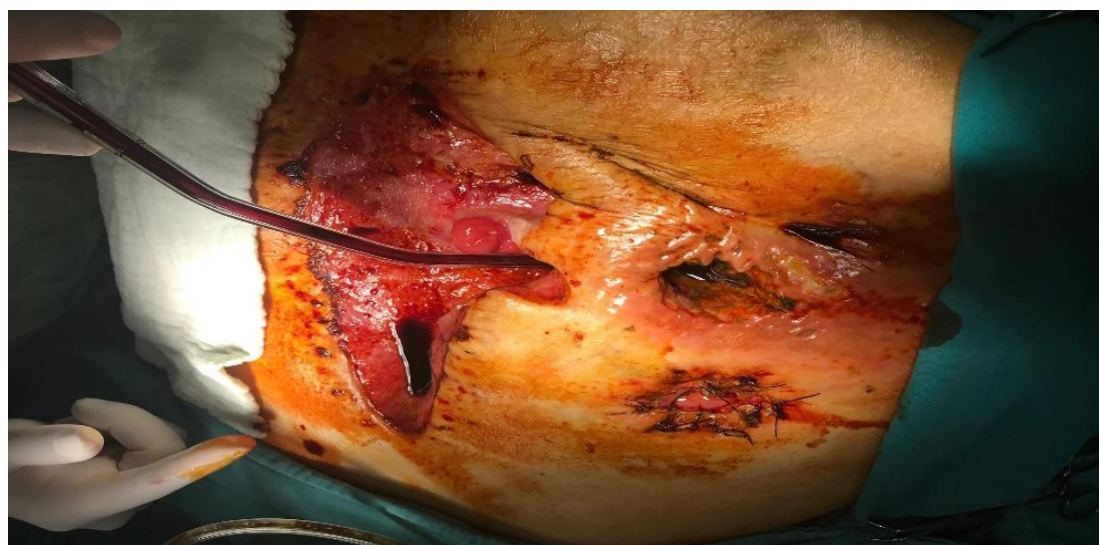
Figure 1 The first status of the EAF and grade 4 open abdomen

A 60 years old female patient had undergone multiple operations due to colon cancer. She had grade 4 OA, high level EAF and due to these liquid-electrolyte imbalance also skin burns, caused from the bile secretion furthermore frozen abdomen and partly septic condition. She had end colostomy made from transvers colon due to rectovaginal fistulae caused by radiotherapy. She was suffering from all these. First we took her to intensive care unit and started to correct the liquid-electrolyte imbalance at the same time the septic condition. We gave total parenteral nutrition(TPN) with omega 3, alanil-glutamin including solutions and trace elements from the central venosus catheter (6-7). According to the blood culture received that before was given antibiotherapy. Reoperation was impossible because of frozen abdomen and heavy adhesions. According to radiologic measurements, at the distance nearly 60 cm from the treitz ligament, there was whole seperated small bowel from its distal one. The distance between seperated small bowels were nearly 10 cm and these ones were adhesive to around tissues.