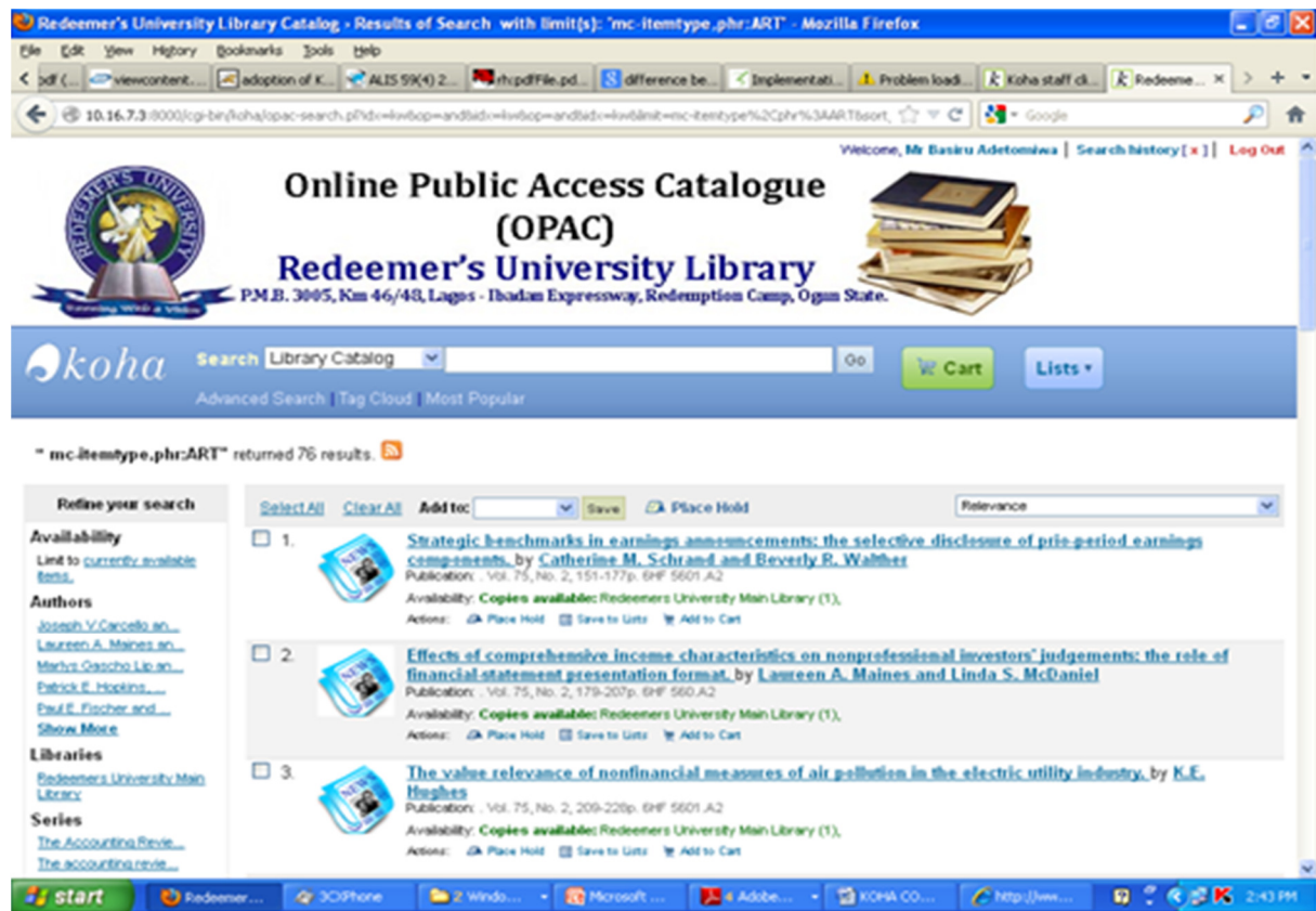
Figure 2 showing the OPAC interface of the koha version 3.06 before the upgrade.