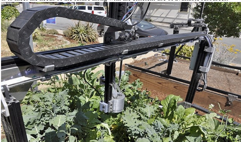
Fig 4. Farm Bot [5]

The use of IoT in various fields like Agriculture to benefit the farmers, traders and other stakeholders is a novel idea. Many countries like China, Taiwan, European countries like Czech Republic etc. have already taken initiatives in this area [6][7]. Smart agriculture or Precision agriculture is the new buzzword in such countries. Taiwan government's i236 Project (Smart Living Technology Application Project) lays focus on various key areas including farming. Projects like Farmbot (Figure 5) have created intelligent machines for precision farming [8][9]. The challenge is to meet the needs of the future along with the efficient use of available resources.