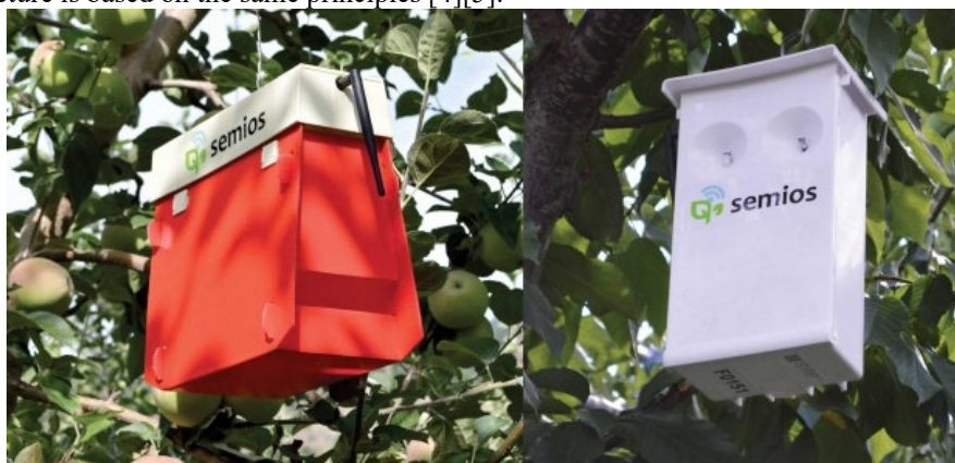
Fig 2. SemiosBIO Company's sensor connected through cellular network and used on trees for pest control

IoT can help you with your situation in agriculture. There are a lot of use cases in the agriculture industry that IoT can help you to solve. But for each use case, the final solution will be slightly different, even if the general system architecture is based on the same principles [4][5].