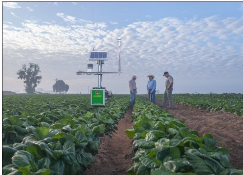
Fig 3. John Deere's Field Connect system used to collect soil, moisture and other data