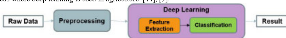
Figure 2: Deep Learning Approach (Adapted from [52])

Deep Learning algorithms have been used in agriculture in a variety of ways. Recurrent Neural Networks (RNN), Convolutional Neural Networks (CNN), and Generative Adversarial Networks (GAN) are examples of these (GAN). Deep Neural Networks can extract their features, allowing them to prompt multifaceted relationships or patterns amongst the data [52]. Convolutional neural networks (CNNs) are Deep Learning models that interact with images by extracting features or objects and learning to differentiate between them [18]. Deep learning enables computational models with multiple layers of processing that represent multiple data levels of abstraction. The layering aspect is learned from data rather than created by humans using a general-purpose learning technique. Several Deep Learning algorithms rely heavily on the Back Propagation Neural Network. Weather forecasting, plant disease detection, image translation, fruit counting, land classification, obstacle detection, plant classification, weed identification, animal behavior classification, and yield prediction are all areas where deep learning is used in agriculture [44], [9].