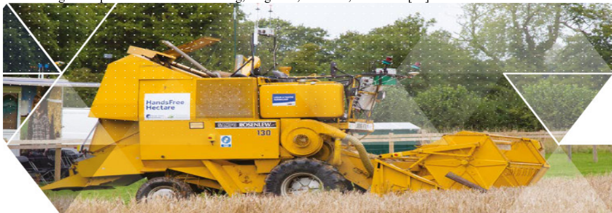
Figure 5: Autonomous Harvester (adapted from [10])

Agricultural Machinery Management: Agricultural machinery, such as tractors, must be managed to improve agricultural efficiency, competitiveness, and sustainability. Integrating these types of machinery with smart technologies will aid in reducing negative environmental effects, increasing soil productivity, and promoting economic yields. Smart agricultural machines are quick, versatile, precise, and intelligent, with low carbon dioxide emissions and bioenergy utilization [1]. IoT-enabled agricultural machinery can boost crop productivity while reducing grain losses. Furthermore, the use of global positioning systems and global navigation satellite systems can improve machinery because they can be driven in autopilot mode. Machines with vehicles, unmanned aerial vehicles, and robots can be controlled remotely, allowing farmers to map their field management practices such as fertilizing, irrigation, nutrition, and so on [11].