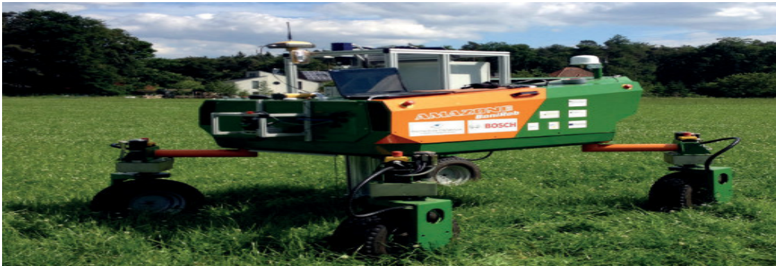
Figure 4: Bonirob (car-sized robot) for measuring soil quality (adapted from [22])

Agricultural Machinery Management: Agricultural machinery, such as tractors, must be managed to improve agricultural efficiency, competitiveness, and sustainability. Integrating these types of machinery with smart technologies will aid in reducing negative environmental effects, increasing soil productivity, and promoting economic yields. Smart agricultural machines are quick, versatile, precise, and intelligent, with low carbon dioxide emissions and bioenergy utilization [1]. IoT-enabled agricultural machinery can boost crop productivity while reducing grain losses. Furthermore, the use of global positioning systems and global navigation satellite systems can improve machinery because they can be driven in autopilot mode. Machines with vehicles, unmanned aerial vehicles, and robots can be controlled remotely, allowing farmers to map their field management practices such as fertilizing, irrigation, nutrition, and so on [11].