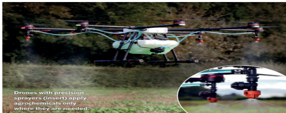
Figure 3: Drones with precision sprayers (adapted from [22])

Weed Control: The direct application of herbicides in the field to control weeds has had a significant impact on the environment and human health complications. Nonetheless, technological advancements have enabled the use of artificial intelligence for safe and risk-free herbicide applications. The use of a rule-based expert system; machine vision; neural network models (backpropagation, counter propagation, and radial basis function-based model); and image analysis are among the approaches that are now taking center stage in weed identification and elimination [47]. Artificial intelligence sensors can detect and target weeds before determining which herbicides are needed and when. As a result, we save money by not using as many herbicides and we reduce the number of toxins in our food. Machine vision can aid in site-specific crop management by detecting and distinguishing the presence of weeds in the crop and identifying the weed for the appropriate chemical to spray [27].