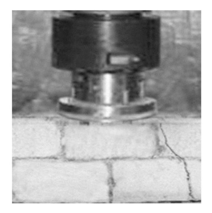
Figure (3): Shear Failure for Beam Tests.