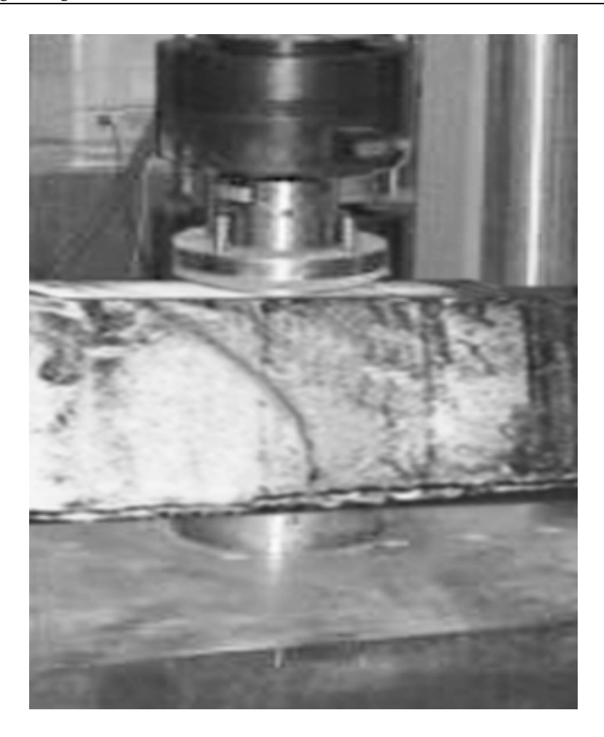
Figure (4): Shear Failure of Beam with GFRP.