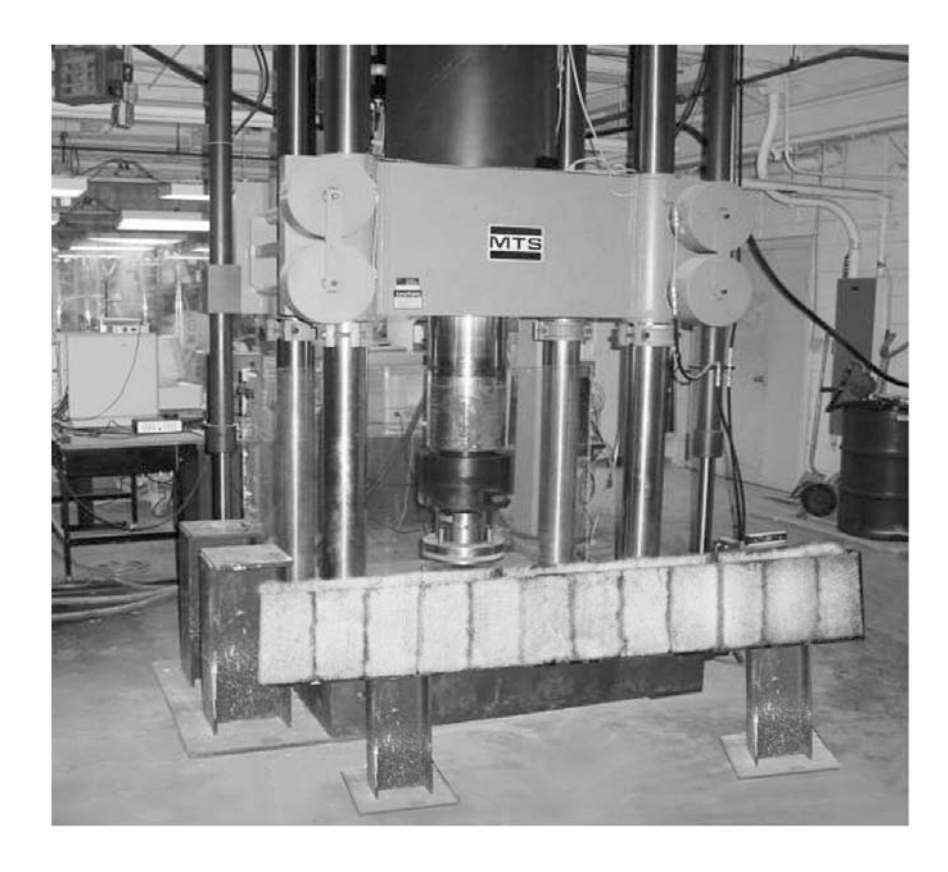
Figure (1): Test Set-up.

The masonry blocks used in the study were conventional 20 x 20 x 40 cm concrete hollow-blocks. The average thickness of the face shell was 2.5 cm. The properties of the blocks were determined in accordance with ASTM C-140. The compressive strength of the masonry was determined using two techniques. In the first case, the net strength of one block was measured and found to be 11.66 MPa. In addition, three course grouted prisms (ASTM E-447) were tested and the compressive strength was measured to be 7.79 MPa. The splitting tensile (ASTM C-1006) was found to be 1.13 MPa, while the flexural strength (ASTM C-67) was found to be 2.79 MPa.