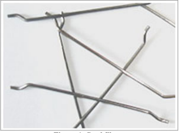
Figure 1: Steel fibers

necessary for fixing the specimen in the testing machine and for measuring strain. The remaining 150 mm bar length was covered inside the specimen. The modulus of elasticity of the high tensile strength steel bar was 206 GPa and its proof strength was 358 MPa. Table 1 lists the specifics of each test specimen.