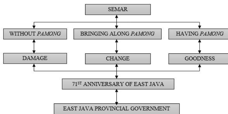
Figure 4: The Relationship between the events of Semar Sang Pamomong play with East Java Province