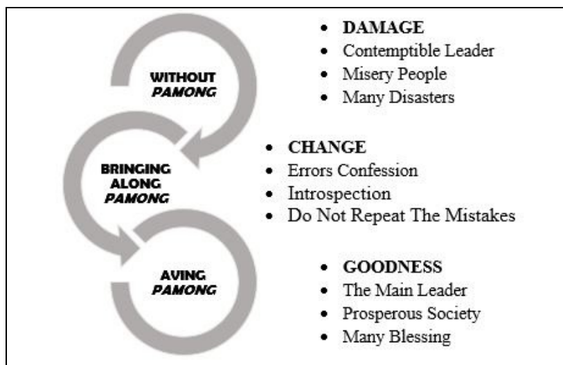
Figure 3: The events of Semar Sang Pamomong play