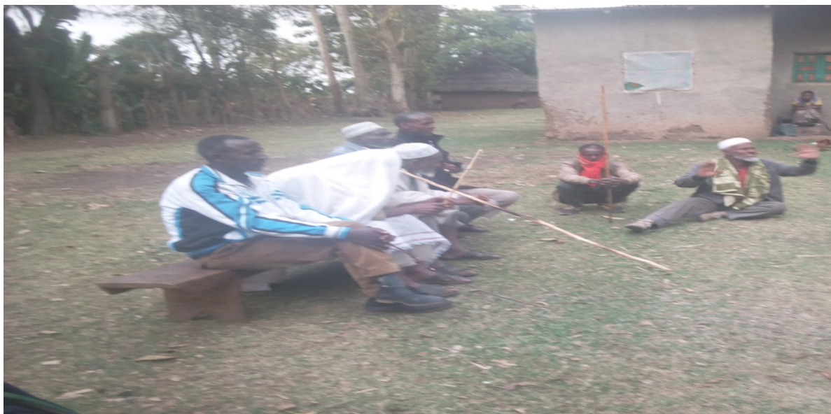
Image one. When the informants are interviewing