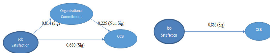
Feature2. Theoretical Role in Mediation