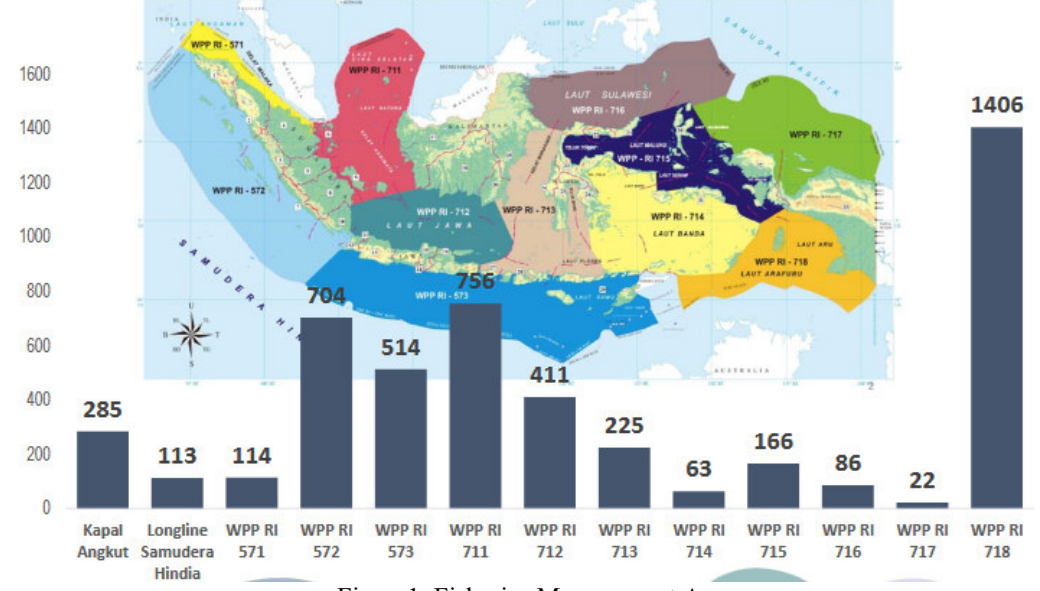
Figure 1. Fisheries Management Area

According to report of Minister of Marine Affairs and Fisheries [2]The study on the effectiveness of cantrang fishing gear has been conducted by research and the results of the study indicate that catches are not selective, the results of the catch are those that have not been caught in catch, and the results of bycatch can be over 50% more. This is the distribution of fishing vessels> 30 GT in Indonesian Fisheries Management Area