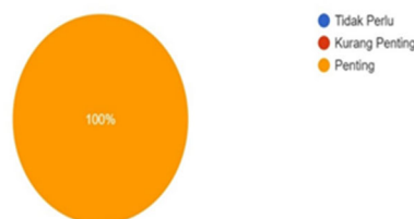
Bagaimana pendapat Anda tentang pentingnya materi Pendidikan anti korupsi yang diajarkan di Lembaga Pendidikan, khususnya di Polinema! 200 responses

The findings show that 100% or all students of State Polytechnique of Malang states that anti-corruption education is crucial to be given in State Polytechnique of Malang.