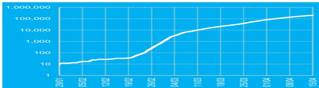
Figure 1. Confirmed Cases of Covid-19 in Member Countries of the Organization of Islamic Cooperation

The picture above shows that the development of Covid-19 in the Organization of Islamic Cooperation countries is divided into two phases. In the first phase, from February 24 to March 11, 2020, confirmed cases in the OIC group of countries increased from about 100 to 10,000, and the time to increase in cases was 2 to 5 days. Then the increase in case time increased to 7 days in the second phase. In other words, there is an increase in cases every week (Organisation of Islamic Cooperation, 2020).