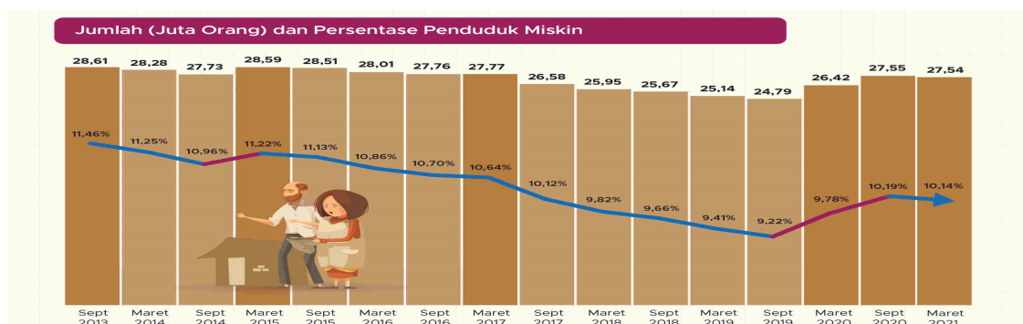
Figure 2. Poverty Profile in Indonesia March 2021

Meanwhile, in the context of poverty, BPS data for March 2021 shows that the average poor household in Indonesia has 4.49 household members. Thus, the size of the poverty line per poor household on average is IDR 2,121,637.00/poor household/month. The Poverty Line in March 2021 was recorded at Rp. 472,525.00/capita/month with the composition of the Food Poverty Line of Rp. 349,474.00 (73.96 percent) and the Non-Food Poverty Line of Rp. 123,051.00 (26.04 percent). The image below shows the poverty rate in Indonesia until March 2021.