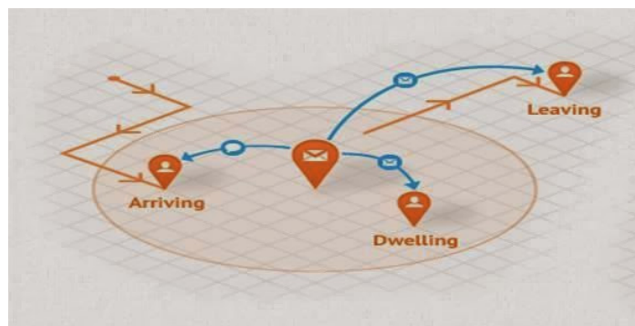
Figure 4: Logistics Geofencing Applications

Variances and subtle changes within the logistics and transportation industry can greatly affect, often negatively, a firm’s profitability and competitiveness. Hence, the logistics and transportation field benefits from automation and thus geofencing solutions can be used to accomplish the following types of efficiency outcomes: 29,30