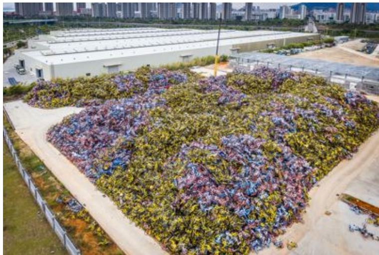
Figure 3: Image of Discarded/Impounded Shared Bikes

According to the source, there are in excess of a 120,000 bikes in this single image. This amounts to at least half a million (US$) in inventory at about $4.20 a bike which is probably a conservative estimate in wholesale cost. The bikes that ofo utilizes are built especially for the firm and according to its own specifications. This also includes the bespoke locking mechanisms that keep them from being stolen or utilized without paying. Of course, ordering these bikes in such high volume allows ofo and its competitors to benefit from cost reductions achieved through volume rates. Rare is the company that can profitably afford to replace its revenue producing resources every year or so which is why it does not behoove ofo to have so many of its bicycles end up being impounded by whatever municipality they are placed in.