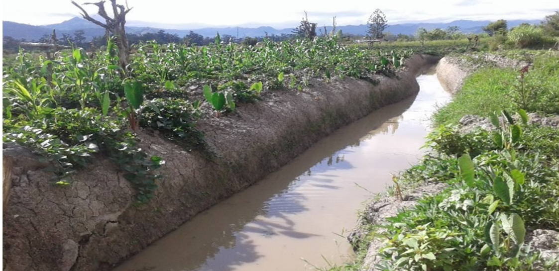
Figure 1. Wen Mina Hipere Farming System

Wen Mina Hipere is a new method of agriculture in the Dani community. The system of sweet potato farming (hipere) that has developed in the Dani community is enhanced by the introduction of fish farming technology (mina) in the trenches of the potato garden. Wen Mina Hipere, modified through the construction of a large moat which acts as a barrier to the wild pigs, is technically qualified to grow freshwater fish while fish feed utilizes the leaves of sweet potato and cattle waste. Dual advantages obtained by the farmers are the increase in production of sweet potato and a source of protein from fish harvests.