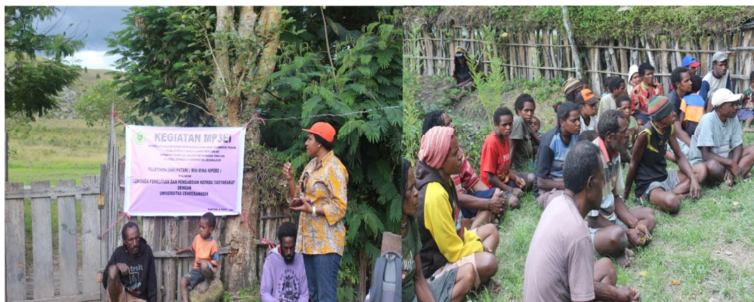
Figure 2: Entrepreneurship and Market Orientation Training

Training of entrepreneurship orientation includes the development of the initiative aspect, and it is shown that prior to the training, farmers have low initiative, especially in developing an idea and trying new things. After training of entrepreneurship is provided, the farmers' mindset changed. The factor of their ability to see opportunities also indicates that farmers can come to recognize opportunities to gain more profit by selling crops and that they intend to maintain as well as increase the harvest. Observation and focus group discussion concluded that farmers have marketed their harvest, both potatoes and fish, to the traditional market.