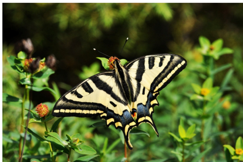
Figure 2. The southern swallowtail ( Papilio alexanor ) resting on Euphorbia glabriflora (Vis.).