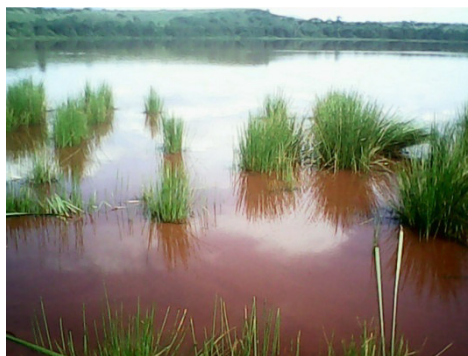
Figure 2; Cyperus lavigatus with the Pinkish waters near the shores of lake Bagusa which turns reddish brown towards the middle of the lake.

Lakes Munyanyange, Murumuri and Nyamunuka were reported by the locals to be seasonal lakes and sometimes evaporate to dryness during the dry seasons. Lakes Katwe, Bunyampaka, Bagusa and Maseche are permanent lakes with very high variations in water volumes between the dry and wet seasons reported by the locals (Table 2). Lakes Katwe, Bunyampaka, and Maseche waters were found to be pea-nut soup green in color (figure 3) while lakes Nyamunuka and Murumuri waters were dark green in color. Lakes Kikorongo and Munyanyange waters were greenish in color. Lake Bagusa waters were pinkish along the shore and reddish brown offshore (figure 2).