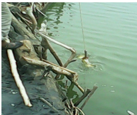
Figure 3: Pea-nut soup green waters from Lake Katwe

Lakes Katwe and Munyanyange had the lowest vegetation cover, estimated to be 35% and 45% respectively. This was followed by Lake Bunyampaka with an estimated vegetation cover of 60%. The rest of the other studied lakes had a vegetation cover estimates of 75% and above (Table 2). Lakes Katwe, Bagusa and Maseche were found to have freshwater wetlands surrounding them in some parts. Cyperus lavigatus , savannah woodland dominated by Acacia woodland and Euphorbia candelabra were the dominant vegetation surrounding these lakes.