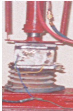
Figure 1 Compression moulding process using the CMR Equipment

The mixed material was molded on a Hydraulic press into pads with dimensions of 6 cm x 4 cm x 2 cm. The mold was first preheated to raise the temperature to 175 °C. As shown in Figure 1 and Figure 2, the mixed material was then placed in the mould and heated for 1 min under a constant pressure of 32.5 MPa; thereafter the moulded material was removed and cooled at room temperature for 8 mins as outlined on Figure 2a-d.