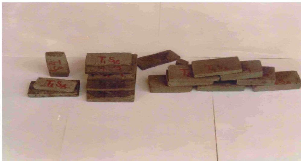
Plate 1 Kenaf brake pad samples