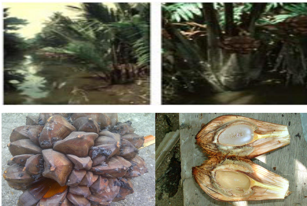
Figure 1: The Nipa Palm, Flowers and its Fruits

The phytochemical characterisation of the husk and seeds of Nypa fruticans revealed the presence of polyphenols and tannins in the husk while the seeds showed traces of alkaloids. Flavonoids, anthraquinones were noted to be absent in Nypa fruticans (Osabor et al, 2008). Nipa palm seed was found to show good electrical insulating properties. Within the ambit of experimental accuracy Ukpong (6), in his work, a study of the electrical properties of nipa palm seed, observed that nipa palm seed have very high bulk resistivity of about (1.90 - 3.80) \times 10^6 \Omega\text{m} , conductivity range (2.5- 5.2) \times 10^{-7} \Omega\text{m}^{-1} . Its resistivity is very high while the conductivity is very low. Electrons tunnel from electronic states at the insulator/phosphor interface is a necessary step to produce electroluminescence