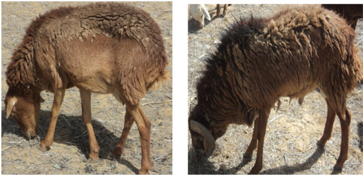
FIGURE 4. ADULT FEMALE (LEFT IMAGE) AND MALE (RIGHT IMAGE) OF THE HIGHLAND SHEEP

The highland sheep flock composed of lambs, rams, and ewe that survived and reproduced in the highland dry agro ecology of Atsbiwonberta. The highland sheep developed an adaptive mechanism to the cool and dry weather condition through its hair type. It owned attractive body color and body shape, which are the base for community based sheep breed improvement (Fig 2).