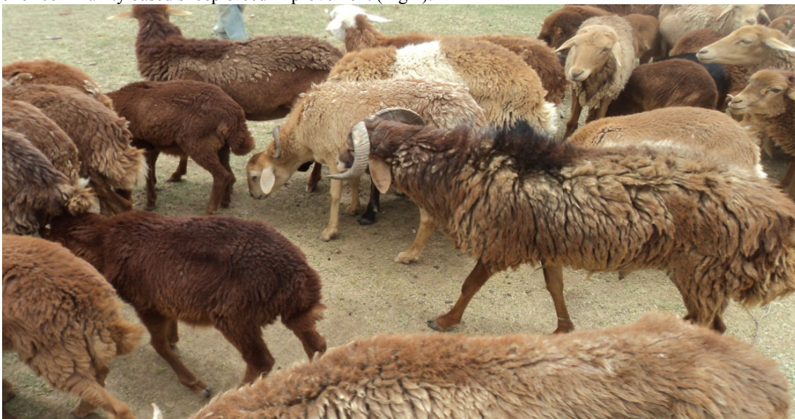
FIGURE 5. FLOCK OF THE HIGHLAND SHEEP ADAPTED IN THE DRY AREA OF THE ATSBIEWONBERTA DISTRICT

The highland sheep flock composed of lambs, rams, and ewe that survived and reproduced in the highland dry agro ecology of Atsbiwonberta. The highland sheep developed an adaptive mechanism to the cool and dry weather condition through its hair type. It owned attractive body color and body shape, which are the base for community based sheep breed improvement (Fig 2).