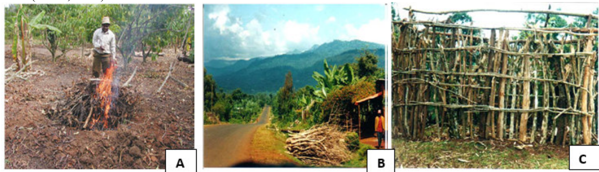
Figure 3. Uprooting and burning CWD infected trees (A), Use of infected trees for fire wood and house construction (B & C)

Cultural weed control activities like slashing and digging should be avoided in CWD-prone coffee fields, and agronomic practices (pruning and stumping) that bring about wounding in coffee trees should be done with efficiently disinfected tools. Disinfection of farm implements such as machetes, bow saws and pruning shears with potent disinfectants (>75% alcohol) followed by intense heating with fire is strongly recommended to farmers whenever pruning, rejuvenating old coffee trees and thinning newly suckers. Farmers' field schools recommend growing cover crops such as Desmodium sp. and haricot bean, which are very efficient in suppressing weeds (so reducing the need for slashing) and as legumes, promote the growth of coffee trees. Applying ash, mulch and slashing between plots with hand weeding around coffee trees were also promising treatments in CWD control trials (CABI, 2005).