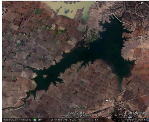
Fig. 2 Satellite image of Raipur reservoir (www. google.com)