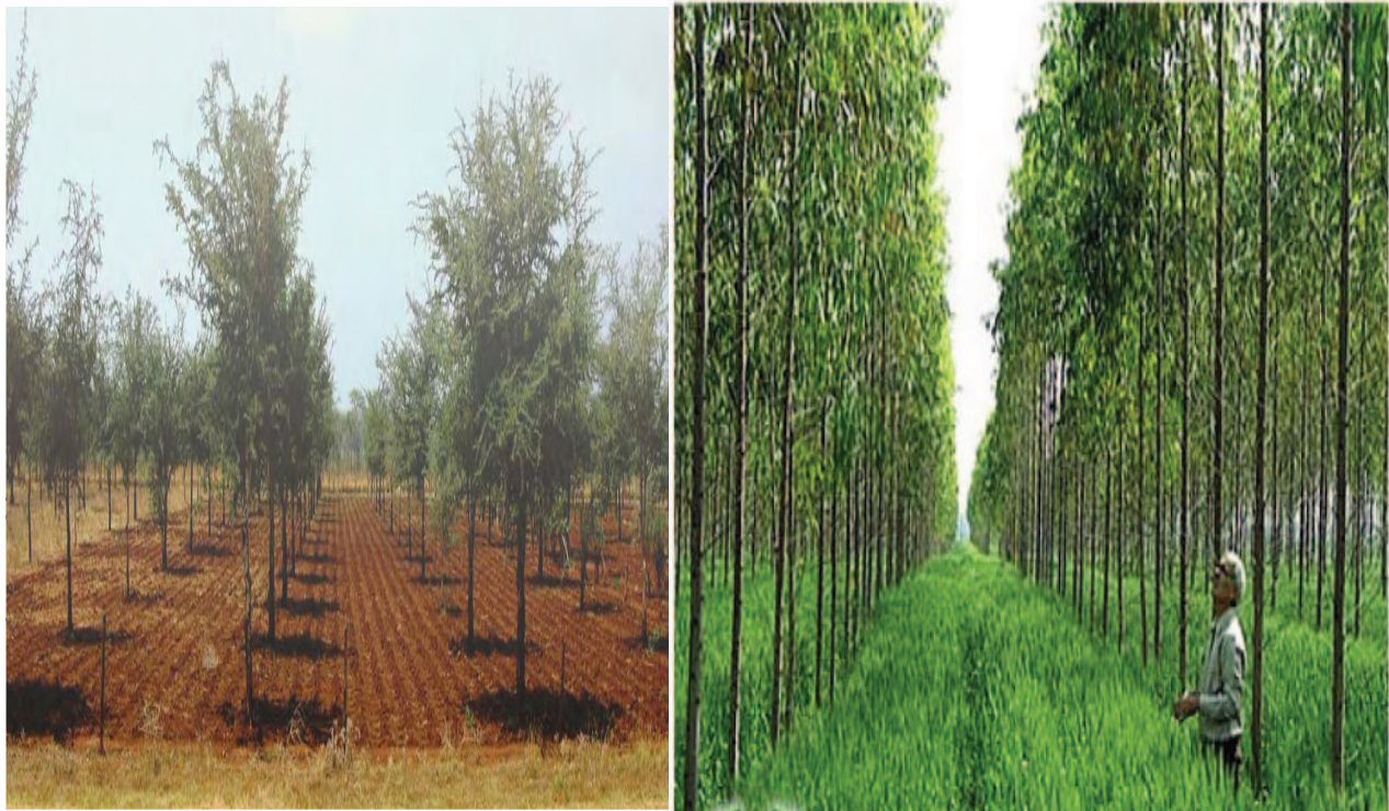
Agroforestry system of alley cropping (Source; Neufeldt et.al , 2009 and Uprety et.al , 2012)

Richard et.al (2014) , reason out the importance of agroforestry with the specific study area in Mwangi district, Kilimanjaro, Tanzania which summarize, Agroforestry is a climate-smart production system and considered more resilient than mono cropping in mitigating climate change. The diversity of agroforestry practices such as parklands, home gardens and woodlots stored a substantial aboveground carbon stock (10.7 to 57.1 Mg C ha -1 with an average of 19.4 Mg C ha -1 , species selection, and planting density for various agroforestry practices to optimize carbon sequestration. Even though, there is difficulty in estimation of carbon sequestration in agroforestry these authors have estimated to be around 548.4 Tg from 54 million hectare which is only from the United States. It indicates that if agroforestry demonstrates worldwide the concentration of carbon dioxide will reduce as a result of utilized for the food preparation of trees and agricultural crops. And selection of multipurpose tree species which have higher capacity in mitigating or sinking carbon should be demonstrated in every country to combat climate change. Hemalatha et.al , (2013) also advocates different research findings on which was done in the benefit of in alley cropping or any other design agroforestry there is higher yield as compare with the mono cropping agricultural crops.