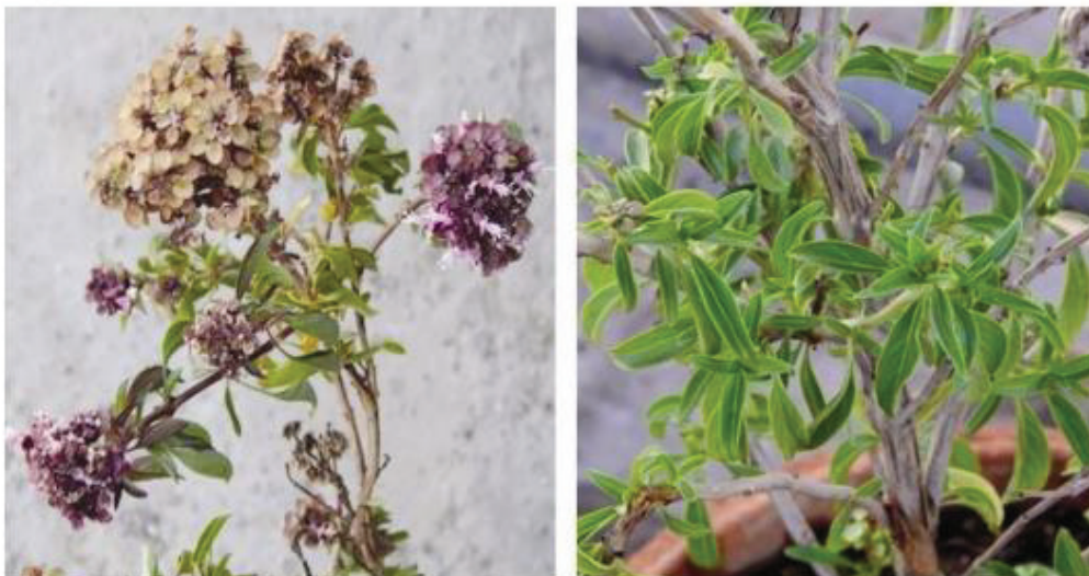
Figure 1: Aerial parts of Origanum majorana L.[4]

The genus Origanum ( Oregano ), an Important genus of the Lamiaceae family, is widespread throughout the world, comprosing about 900 species [3]. (Figure1).