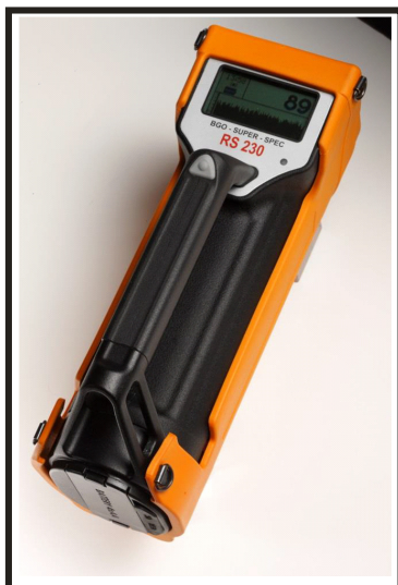
Figure 2. RS-230 BGO Handheld Gamma-Ray Spectrometer.