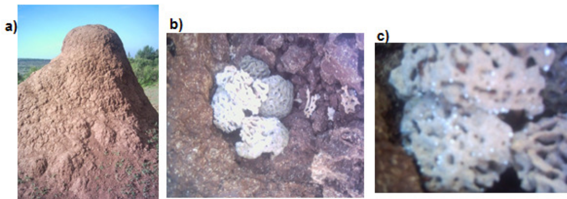
Figure 1. Pictures showing (a) the mound, (b) excavated termite comb and (c) the white nodules picked for isolation of Termitomyces culture.