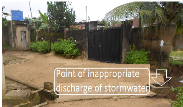
Fig. 4 Ikot Nkebre ecological site in Calabar (Image No. 001)