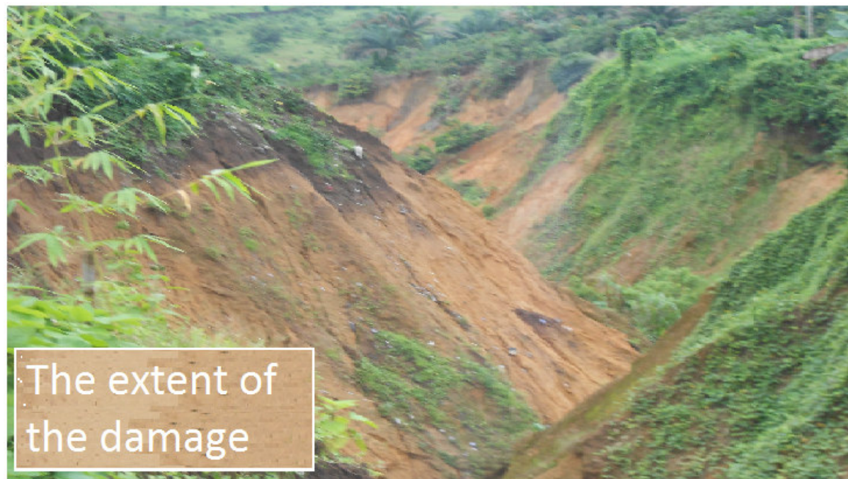
Fig. 6 Ikot Nkebre ecological site in Calabar (Image No. 003)

This study of the Ikot Nkebre Episode in Calabar has revealed the nature of ecological risks that could occur if changes in urban land use, from agriculture to housing, are not undertaken with appropriate professional understanding and diligence [15]. One major threat that has been found to be associated with these phenomena is the inappropriate evacuation of stormwaters from built-up residential sectors. It has been found that, in the course of conversion of agricultural lands into residential estates, due diligence has often not been taken to ensure the inclusion of comprehensive stormwater management systems in the development plans. This is often fraught with very grave ecological consequences. As a result of the omission (of comprehensive stormwater management systems) individual developers often release, without due diligence, the stormwaters contained in the internal stormwater collectors (located within the respective premises) into the open landscape. The common device often consists of the use of collectors or drains which convey stormwaters to the sides of the hills, in the hope that the stormwaters would roll down, by gravity, to the flat valleys below. This hope is hardly ever realized. Without appropriate preparation of the hillsides (to enable them to withstand the energy of the stormwaters), the hillsides quickly collapse under the force of flowing water and gully erosion ensues (see Figs. 4 and 5).