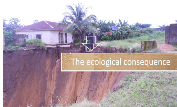
Fig. 5 Ikot Nkebre ecological site in Calabar (Image No. 002)