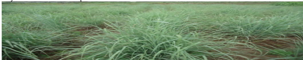
Figure 1 Palmarosa Grass at WGARC experimental field

1.2.3 Cymbopogon Martini (Palmarosa grass): - Palmarosa is a tall perennial grass, with flowering tops and foliage of which contain Sweet-smelling oil of rose like odor. Cymbopogon martini (Palmarosa grass) yields superior oil which is used in perfumery, particularly for flavoring tobacco and blending soaps due to the lasting rose note it imparts to the blend. In soap perfumes, it has a special importance by virtue of geraniol, being stable to alkali. Geraniol is highly valued as a perfume and as a starting material for a large number of synthetic aroma chemicals like geranyl esters which have a permanent rose like odor.