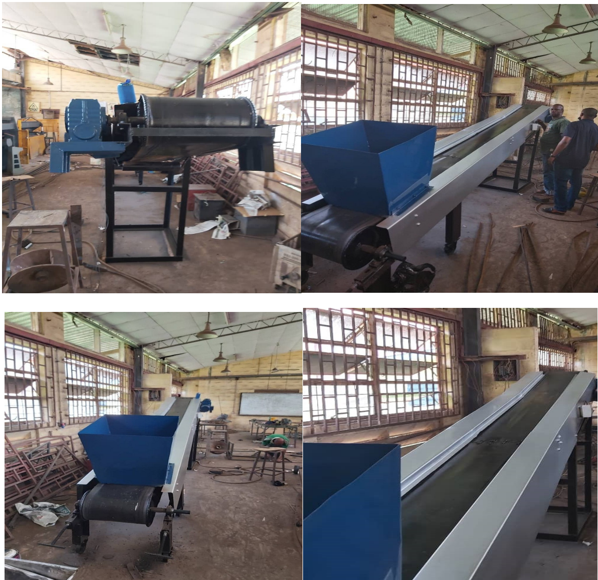
Plate 1 – 4: Completed Belt Conveyor