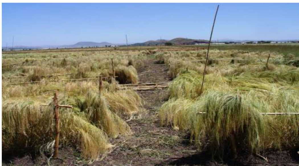
Figure 4. Lodged tef picture

Lodging or the permanent displacement of the stem from the upright position is the major constraint limiting the productivity of the crop especially when it occurs during the grain-filling period, affects both the quality and quantity of the produce (Seyfu, 1993). Harvesting of the crop is difficult because of lodging. Since tef lodges heavily, it is not advisable to use higher rates of fertilizer to increase yield. The current landraces and cultivars used are not lodging resistant and the development of genetically lodging-resistant cultivars is essential (Seyfu, 1997).