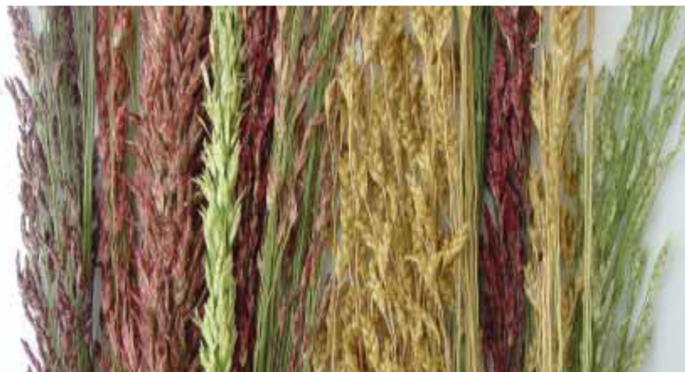
Figure 1: Panicle of wild Tef.