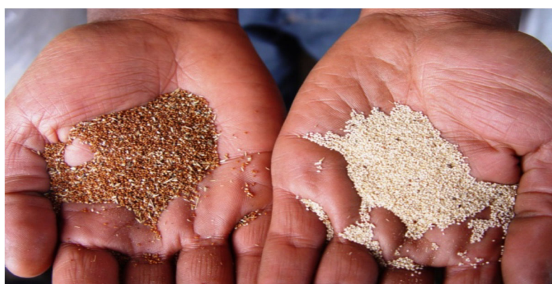
Figure 3: Types of Tef

Lodging or the permanent displacement of the stem from the upright position is the major constraint limiting the productivity of the crop especially when it occurs during the grain-filling period, affects both the quality and quantity of the produce (Seyfu, 1993). Harvesting of the crop is difficult because of lodging. Since tef lodges heavily, it is not advisable to use higher rates of fertilizer to increase yield. The current landraces and cultivars used are not lodging resistant and the development of genetically lodging-resistant cultivars is essential (Seyfu, 1997).