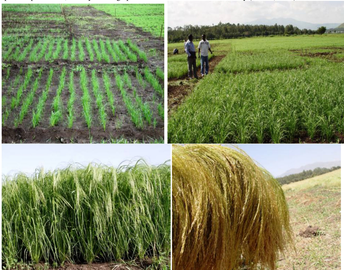
Figure 6: pelleted seed tested.

Further major advantages are that even the smallest seeds when encapsulated in the frozen pellets can be accurately metered during planting operations, precisely positioned and properly spaced. Thus, the amount of seed required can be reduced to a fraction of that previously needed, particularly in view of the significantly improved rate of germination (Tareke, 2010). Precise rows of accurately spaced plants can be attained so as to facilitate subsequent mechanical weeding and cultivation easily done, hence each plant can be assured proper growing room for optimum production, thereby thinning operations can be rendered unnecessary (Tareke, 2010).