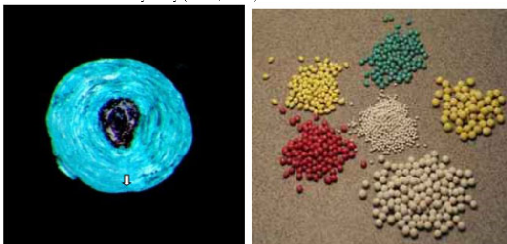
Figure 5: Seed pelleting technology.