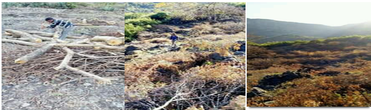
Figure 2 Local communities destruct habitats of gelada baboons for charcoal, fire wood and additional farmland area