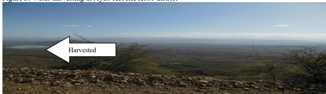
Figure 3: Water harvesting in Ayub Kebele, Kobo district

focus group discussion participants indicated that households preoccupied by temporary benefits are selling the geo-membrane to others with low price, which they took from the government with the intention of construction of water harvesting structures. Despite this fact, informants and participants indicated that households who harvested water benefitted from it using for their livestock and small irrigation (Figure 3). Similarly, Bewket (2009) pointed out that rainwater harvesting and buffering at times of rainfall scarcity through the application of supplemental or protective irrigation might be a good option to protect loss of crop yields, or even complete crop failure.