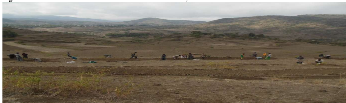
Figure 2: Soil and Water Conservation in Tekulashe Kebele, Kobo district

Table 3 shows that 64.8 and 55 percent of households in highland and lowland mixed farming agro-ecosystems respectively practice soil and water conservation as adaptation to climate change. Studies conducted by Hadgu et al. (2015), Legesse et al. (2013) and Mengistu (2011) have also indicated that farm households used it as adaptation options. Key informants and focus group discussion participants from these agro-ecosystems pointed out that local households have benefitted from such works through claiming degraded lands, improving soil fertility at farm level, improving crop productivity, getting fodder for livestock, and being resilient to drought (Figure 2). This is a good response as previous studies confirmed that the productivity of farmlands/rangelands deteriorated by various factors like traditional farming, overgrazing and deforestation, poor complementary services such as extension and credit, and climatic factors such as drought and flood (Tizale, 2007; Devereux, 2000).