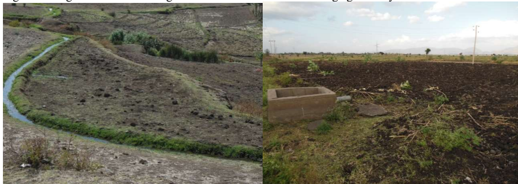
Figure 4: Irrigation schemes in highland and lowland mixed farming agro-ecosystems

Moreover, Table 3 shows that 46.7 and 52.2 percent of households in highland and lowland mixed farming agro-ecosystem practiced irrigation. Studies conducted by Hadgu et al. (2015), Mengistu (2011) and Deressa et al. (2009) have also indicated that farm households used irrigation practices as adaptation options. In so doing, key informants and focus group discussion participants from highland and lowland mixed farming agro-ecosystems has indicated that households who are practicing furrow irrigation through river diversion or ground water have benefitted in reducing crop failure, improving crop productivity, improving food security, and being resilient to drought (Figure 4).